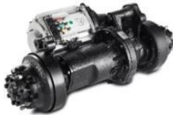
2.5-ton Integrated Powertrain

Transmission Systems. For 15 years, Greenland, along with its subsidiaries, specializes in designing, developing, and manufacturing a wide range of transmission systems for material handling machineries, in particular forklift trucks. The range of the transmission systems covers machineries from one ton to fifteen tons. Most transmission systems contain auto transmission features. This feature allows for easy machine operations. In addition, Greenland provides transmission system for internal combustion powered machineries as well as for electrical powered machineries. Greenland has recently experienced an increasing demand for electric powered transmission systems. These transmission systems are key components for material handling machinery assembly. To meet this increasing demand, Greenland is able to providing these transmission systems to major forklift truck original equipment manufacturers (“OEMs”) as well as certain global branded manufacturers.