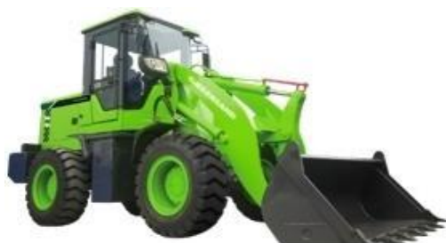
1.8-ton Electric Loader Vehicle

There is increasing demand for electric industrial vehicles powered by sustainable energy in order to reduce air pollution and lower carbon emissions. In December 2020, Greenland launched a new division to focus on the production and sale of electric industrial vehicles—a division that Greenland intends to develop to diversify its product offerings. Greenland’s electric industrial vehicle products currently include GEF-series electric forklifts, a series of lithium powered forklifts with three models ranging in size from 1.8 tons to 3.5 tons, GEL-1800, a 1.8 ton rated load lithium powered electric wheeled front loader, and GEX-8000, an all-electric 8.0 ton rated load lithium powered wheeled excavator. These products have become available for purchase in the U.S. market. In July 2022, Greenland launched its new GEL-5000 all-electric 5.0 ton rated load lithium wheeled front loader. Greenland plans to launch a 54,000 square foot assembly site in Baltimore, Maryland in the third quarter of 2022 to support local service, assembly and distribution of its electric industrial heavy equipment product line. Greenland also plans to establish an experience center within the Mid-Atlantic region in 2023 to promote local sales and marketing.