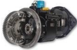
Hydraulic Transmission System

Transmission Systems. For 15 years, Greenland, along with its subsidiaries, specializes in designing, developing, and manufacturing a wide range of transmission systems for material handling machineries, in particular forklift trucks. The range of the transmission systems covers machineries from one ton to fifteen tons. Most transmission systems contain auto transmission features. This feature allows for easy machine operations. In addition, Greenland provides transmission system for internal combustion powered machineries as well as for electrical powered machineries. Greenland has recently experienced an increasing demand for electric powered transmission systems. These transmission systems are key components for material handling machinery assembly. To meet this increasing demand, Greenland is able to providing these transmission systems to major forklift truck original equipment manufacturers (“OEMs”) as well as certain global branded manufacturers.